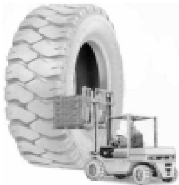
NON-MARKING TIRES IN PRESS ON AND SOLID-PNEUMATIC STYLE