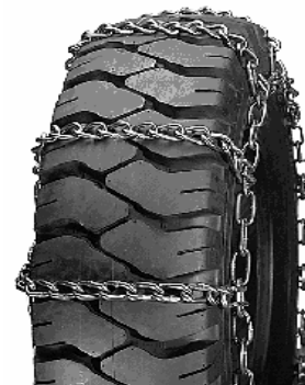
ASK ABOUT OUR TIRE CHAINS

"SOLID-DEAL AD-TRAK'S natural rubber compounds offer low rolling resistance & low heat build up. Suitable for Electric & IC Trucks, trailers & support equipment. Full thickness steel bands offer greater protection to wheels." - Are your tires all natural rubber?