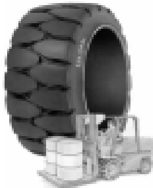
PRESS ON CUSHIONS

OUR COMMITMENT IS TO SUPPLY OUR CUSTOMERS WITH EVERY TIRE, AND TIRE RELATED NEED. TOYOTA-LIFT OF MINNESOTA IS YOUR "TOTAL-SOURCE" MATERIAL HANDLING PROVIDER.